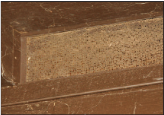
This screen prevented embers from entering.