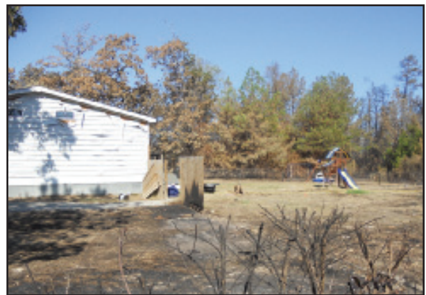
This home escaped the flames when firefighters knocked down the burning fence that would have led flames to the home. Notice the burn marks on the fence.