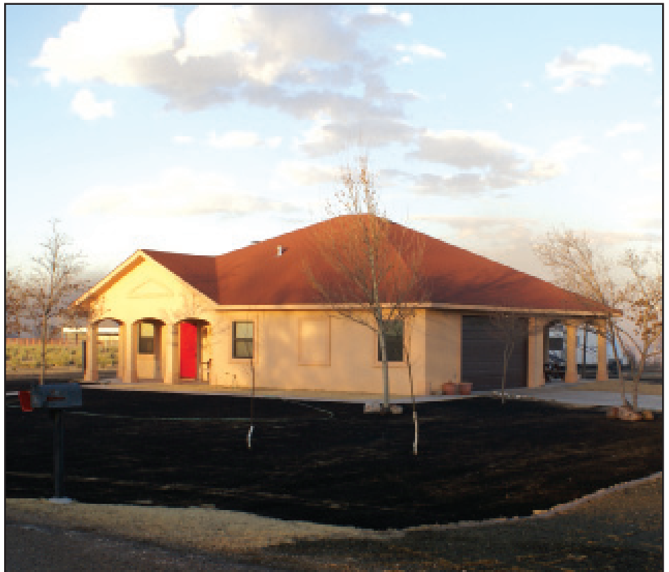
Firewise construction and landscaping helped protect this home from wildfire.

“Hardening a home” is a term used to describe the retrofitting process that reduces a home’s risk to wildfire. This involves using non-combustible building materials and keeping the area around your home free of debris. The following pages will describe each section and offer alternative building materials that will reduce a home’s risk to wildfire.