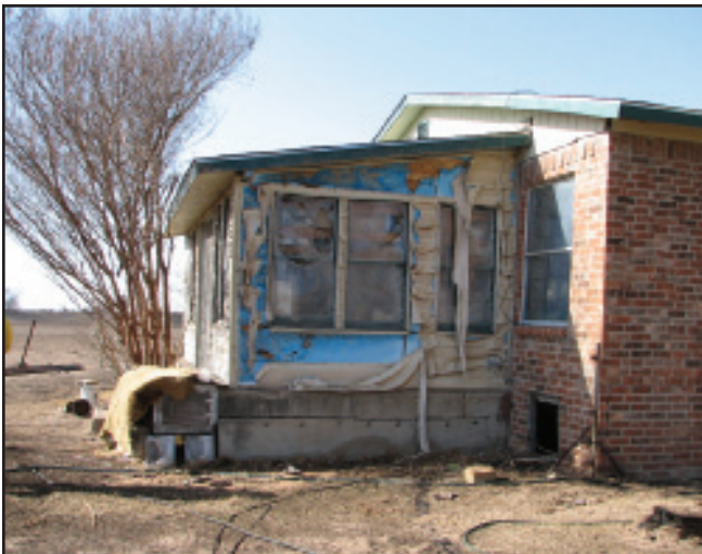
The vinyl siding and window frame on this home melted when exposed to radiant heat.

Use non-combustible siding and make sure there are no crevices or holes that could potentially catch embers.