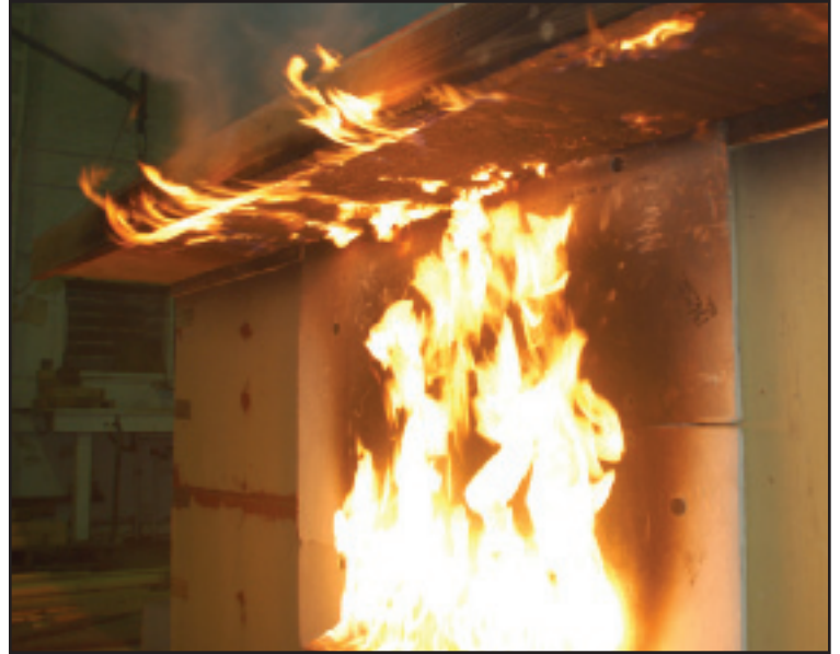
Direct flame on siding burns into the eaves and roof.

Angle flashing also should be used, as discussed in the roof section of this guide.