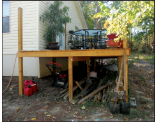
Materials under this deck could easily catch the home on fire.