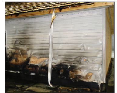
This vinyl gutter melted from heat, exposing the wood and roof edge to embers and direct flame.

Install gutter guards to keep debris from accumulating. Maintain the roof where the gutter connects to make sure debris does not accumulate between the guard and roof.