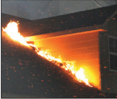
Leaves and needles burning along roof edge with dormer.