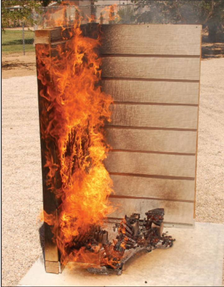
This photo shows the difference between combustible siding (left) and fiber cement siding (right) when exposed to the same direct flame source.

The exterior walls of a home will need to be resistant to radiant heat and direct flame contact. For homes with vinyl siding, the radiant heat from a wildfire may become intense enough to melt the siding. This could possibly expose crevices in a home and allow embers to enter.