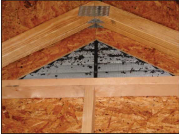
Screening helped capture these embers and prevent their entry into the attic.