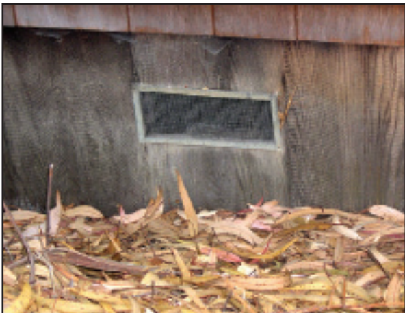
Combustible material like this mulch, near skirting or siding, leaves the home unprotected, even with screening in place.

There are several different types of vents for a home. These vents play a vital role by supplying openings for air to flow through. However, these vents can allow embers to enter a home during a wildfire.