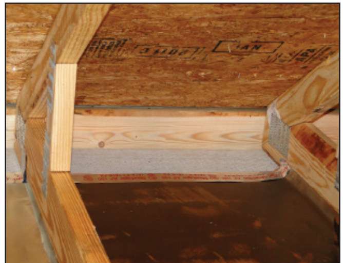
With roof edge flashing, fewer embers enter the attic area.