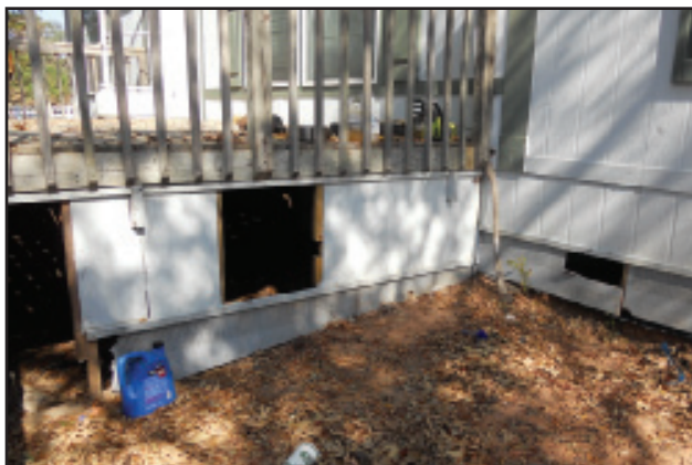
The flammable skirting under this deck, along with mulch, could easily lead flames to the deck and home.