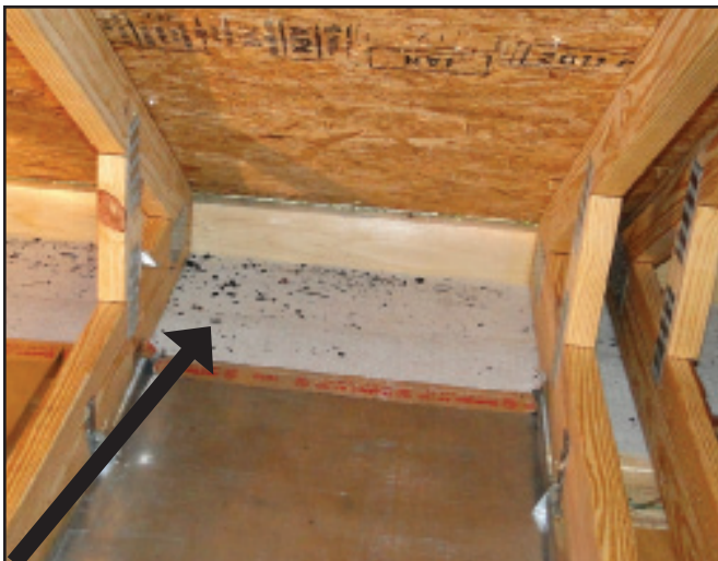
Without roof edge flashing, embers can enter into the attic. Photo by Institute for Business and Safety Research Center.

Box in eaves with non-combustible material.