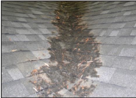
The pine needles on this roof burned, but the Class A roof did not.

The roof is one of the most vulnerable areas of a home. It is a large surface that is capable of catching embers during a wildfire. A roof also can collect dead vegetation such as pine needles and leaf litter, which will readily ignite. So the maintenance of a roof is as important as the materials used to construct it.