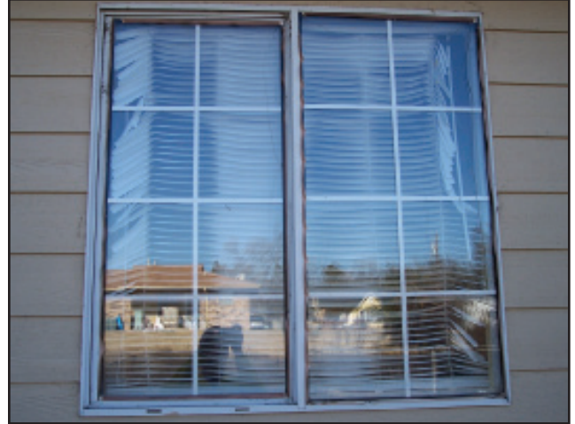
Radiant heat melted the interior blinds.

Window screens also play a vital role during a wildfire. They will absorb and redirect radiant heat, allowing the glass to absorb less. If the glass breaks, screens may also prevent embers from entering.