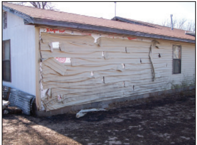
When this vinyl siding melted, it exposed other combustible materials.