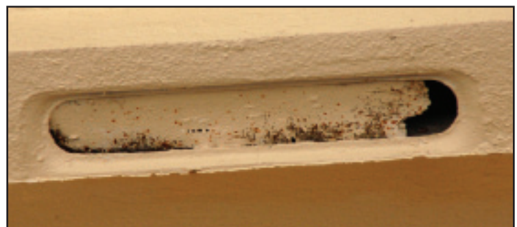
Vents can clog. This vent was painted over, reducing its effectiveness in providing ventilation.